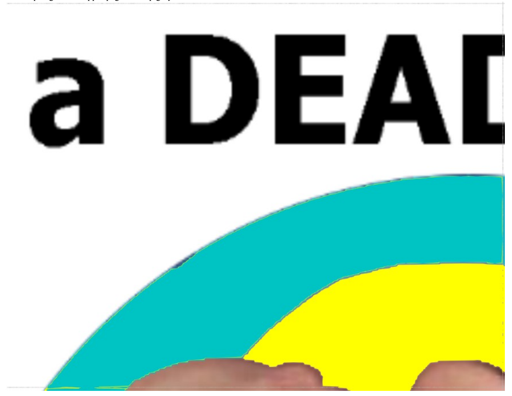
Page 3: CUT <u>BOTTOM EDGE</u> of photo (at fine Gray Line) AND Cut <u>Right Side</u> (at fine Gray Line). Slide top edge under upper page Line up gray line.